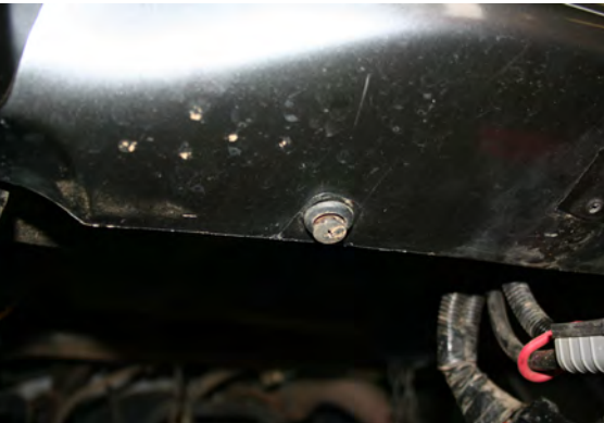
Fig 1 Fig 2