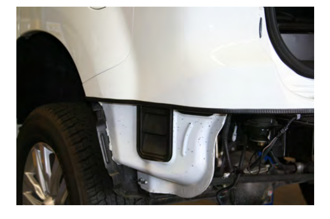
Fig 18 Fig 19

12. Using a grinder with 1mm cutting disc cut the bottom section of bumper off starting at the wheel arch. Debur cut edge and fit pinchweld (supplied) all the way along cut edge (refer Figs 18 &19)