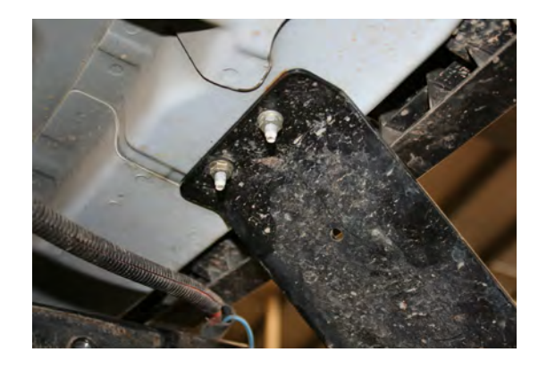
Fig 9 Fig 10

7. Remove the three metal bumper support brackets (These will not be reused) (refer Fig 9 & 10)