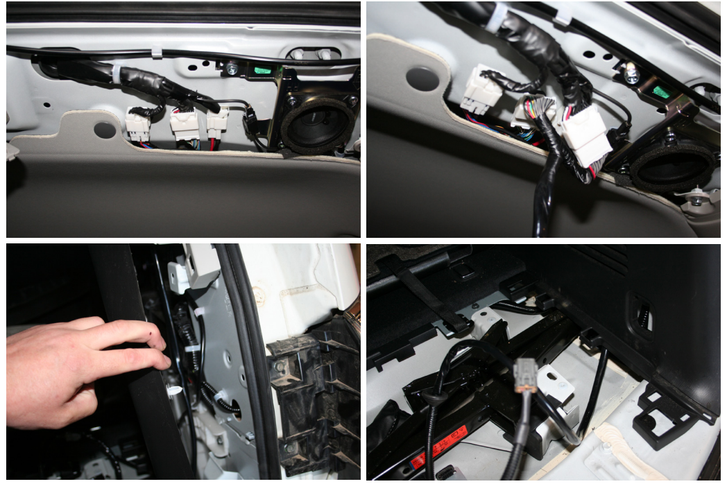
(R/H side shown)

3. Unclip the plastic roof trim to expose the three plugs in the roof. Unplug the centre plug and fit the two way camera harness, Y62-CAM-1. Unclip the upper and lower trim on the appropriate side just enough to run the harness down to the floor compartment.