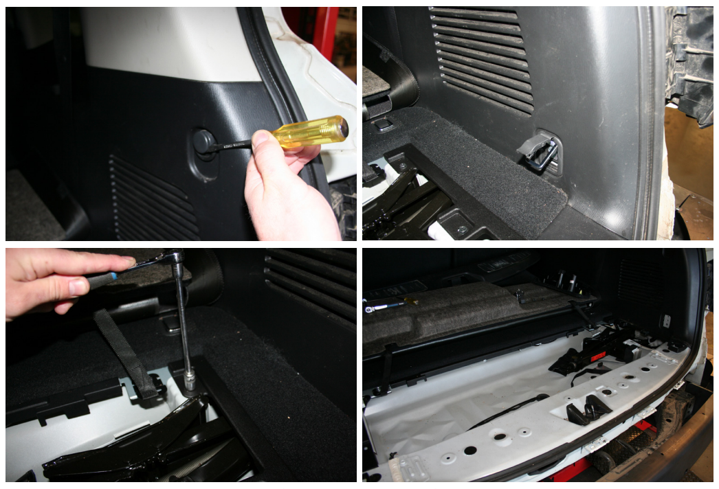
(R/H side shown)

2. Depending on which side of the vehicle the camera is being installed, remove upper and lower tie down hooks. Remove small section of floor by undoing two screws then remove the plastic floor trim.